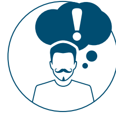
Bring Brand Awareness