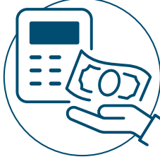
Getting Performance On A Limited Budget