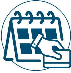
Convert Single Donors Into Monthly Patrons